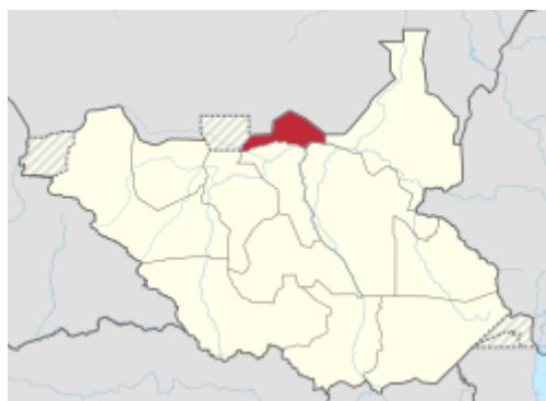
Location of the Ruweng Administrative Area in South Sudan